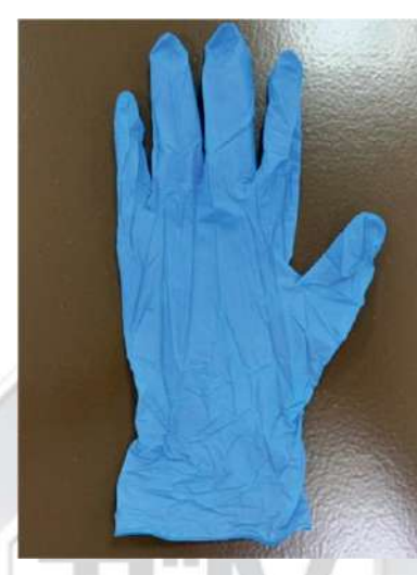
Figure 1: Photograph of Nitrile Examination Powder Free Gloves (Lot No.: A20200008)