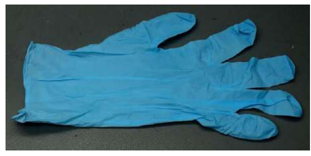
Photo: Nitrile Examination Powder Free Gloves, ASTHER, Blue, Lot No. A20200008