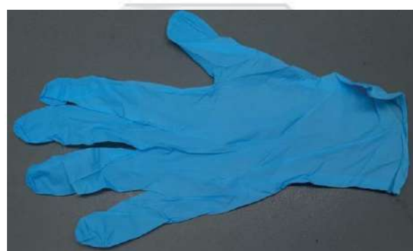
Photo 1: Nitrile Examination Powder Free Gloves, ASTHER, Blue, Size M, Lot No. A20200008