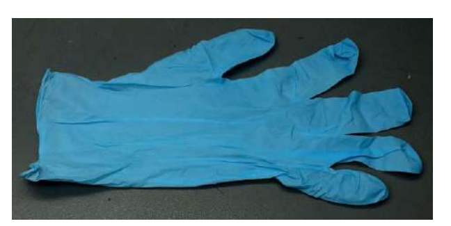
Photo: Nitrile Examination Powder Free Gloves, ASTHER, Blue, Lot No. A20200008